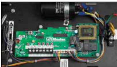
Includes the Medium-Duty Logic Board with Built-In Receiver